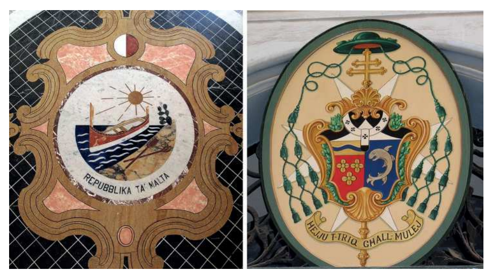
Figure 2: Left: The arms of Malta (1975–1988); Right: the arms of Archbishop Paul Cremona of Malta.

This paper is about recent events, but these cannot be divorced from Malta's heraldic past, dominated by its historical position as the possession and headquarters of the Order of Malta from 1530 until 1798. Hospitaller heraldry is omnipresent in Malta, most wondrously in the memorial slabs of the knights of the Order in the Co-Cathedral of St John in Valetta ( Figure 1 ) and in the Metropolitan Cathedral of Saint Paul in Mdina. Other heraldry is also much in evidence ( Figure 2 ).