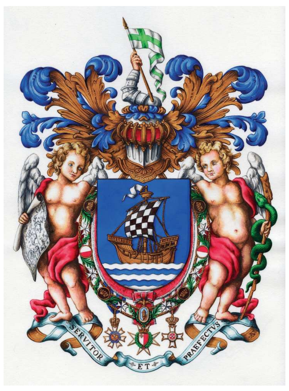
Figure 4: Arms of Dr. George Vella, President of Malta, courtesy of The Chief Herald of Malta (grant individual).