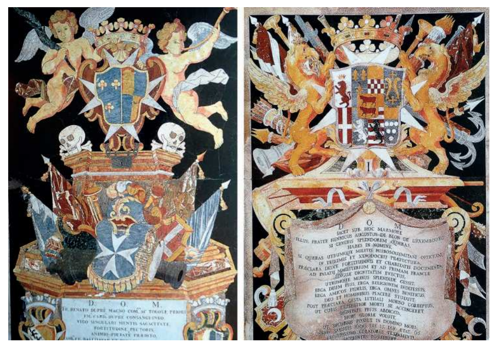
Figure 1: Memorials to knights of Malta on the floor of St John's Co-Cathedral in Valetta.

In the case of Malta, no place is richer in heraldic display, in large part associated with the Order of Malta.<sup>3</sup> Much of this is the hereditary heraldry of the knights of the various Langues<sup>4</sup>; some is derived from the nation states which held or exercised sovereignty over the country both before the arrival of the Order, and since its departure; some was granted by the Grand Masters pursuant to the sovereign powers which they exercised (and continue to and exercise, although no longer over Malta itself). It can be expected that there will be an increasing amount of heraldry granted in exercise of the sovereign powers of the Republic of Malta.<sup>5</sup>